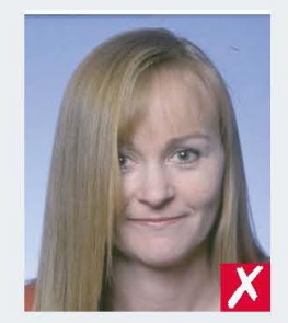
hair across eyes